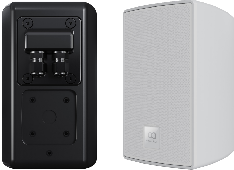
Product shown with terminal cover accessory – sold separately.

When coupled with the Zone series, a ZonePad and the WebApp makes setting up a system and end user control simple and intuitive.