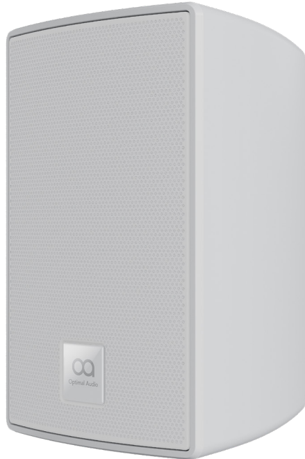
Product shown with terminal cover accessory – sold separately.