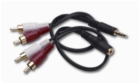
AV-AC2 Cable Kit (included with AV-HK1), Includes: 1 each Dual Phono to Stereo 1/8 in. (3.5 mm) Mini-plug; Length: 8 in. (20 cm) + connectors 1 each Dual Phono to Stereo 1/8 in. (3.5 mm) Mini-jack; Length: 8 in. (20 cm) + connectors

The AV-HK1 is a rugged product designed for portable use. For fixed installations, a mounting bracket is included. Many consumer audio inputs and outputs use stereo mini-plugs and jacks. The AV-HK1 includes two adapter cables to interface with these products. The cable kits are also available separately from RDL in the event a cable becomes worn or lost.