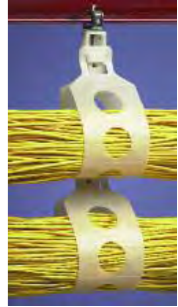
MULTIPLE LOOP HANGERS Stacked, parallel mounting on 1/4" rod