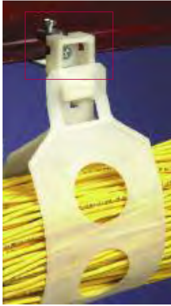
SINGLE LOOP Parallel mounting on 1/4" beam clamp