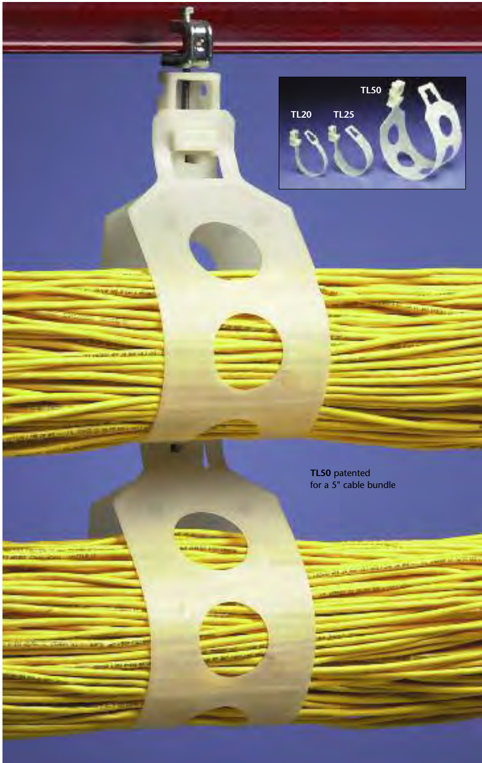
TL50 patented for a 5" cable bundle

The LOOP ® for Communications Cable Support