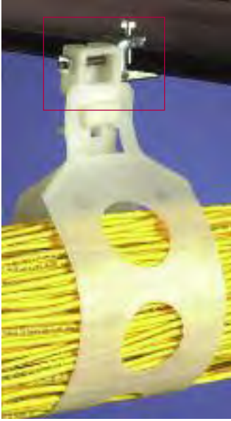
SINGLE LOOP Perpendicular mounting on 1/4" beam clamp

Mount the LOOP in any direction • Rotates to any angle